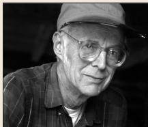
See Page 3